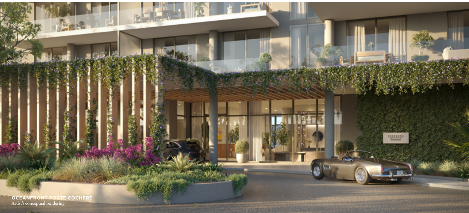
OCEANFRONT PORTE COCHÈRE Artist's conceptual rendering