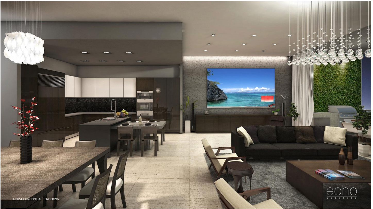
ECHO Aventura pictured below