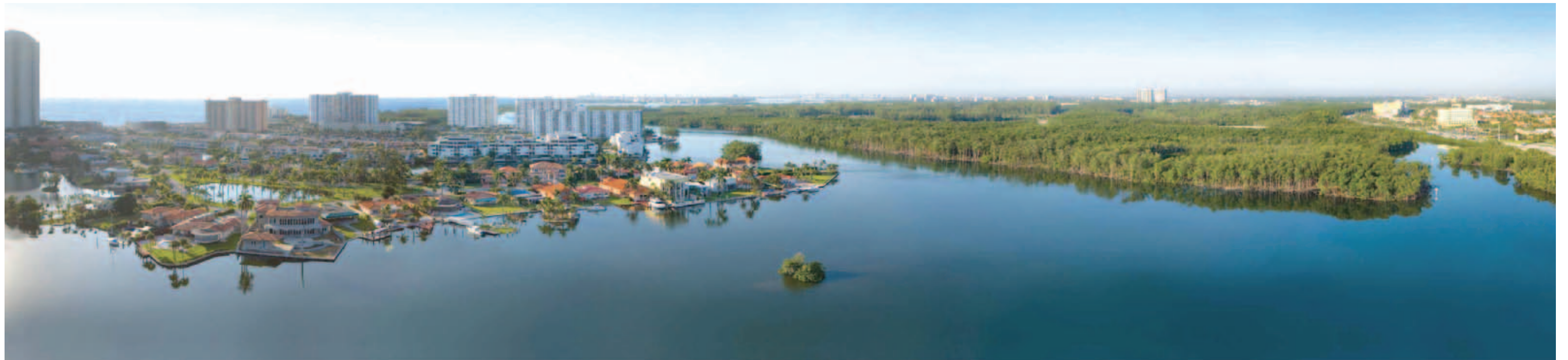
THE VIEW The view from 400 Sunny Isles.